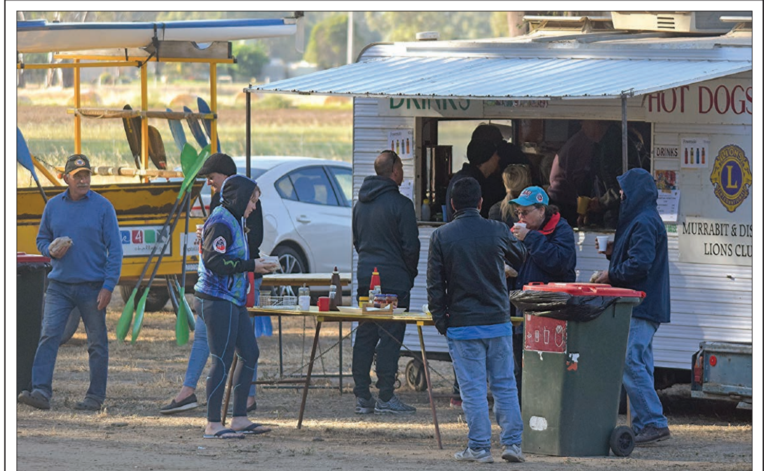
The Lions Club of Murrabit did a roaring trade providing breakfast to hungry Massive Murray Paddle competitors, ground crew and officials.