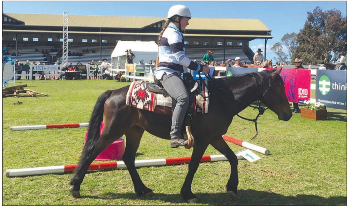
Ariat going through his paces at Equitana.