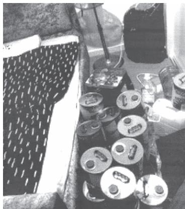
Photos of the crime scene including the meth lab were shown in court.